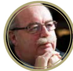
Christophe de Margerie

Honorary Award for the Advancement of International Energy Policy & Diplomacy