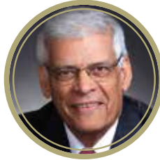
H.E. Abdalla Salem El-Badri