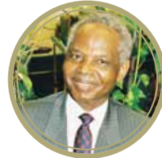
Dr. Rilwanu Lukman

Honorary Award for the Advancement of International Energy Policy & Diplomacy