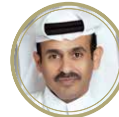
Saad Sherida Al-Kaabi