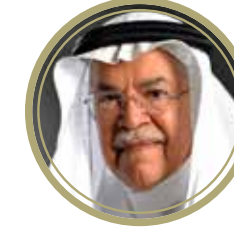
H.E. Ali Al-Naimi

Honorary Award for the Advancement of International Energy Policy & Diplomacy