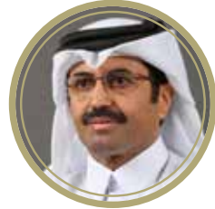
H.E. Dr. Mohammed Bin Saleh Al-Sada