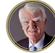
Sir Mark Moody-Stuart

Honorary Award for the Advancement of International Energy Policy & Diplomacy