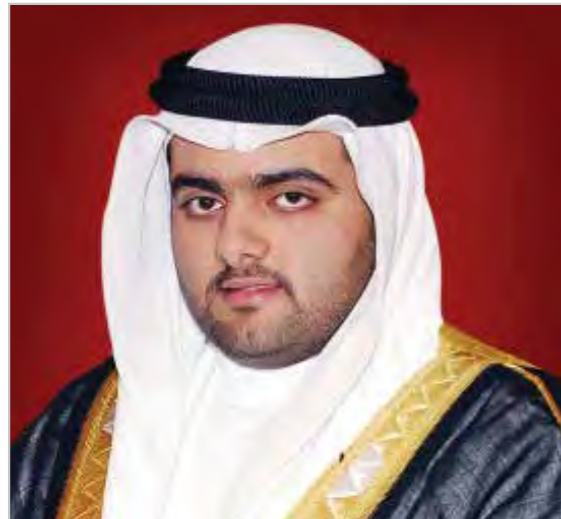
H.H. Sheikh Mohammed bin Hamad bin Mohammed Al Sharqi Crown Prince of Fujairah